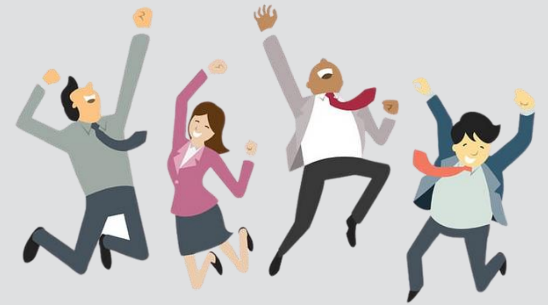
Young, Enthusiastic, Experienced & Hardworking Team