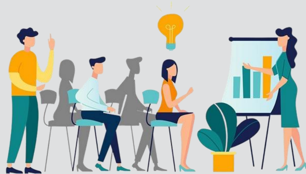
Regular product training for better understanding increasing sales volume