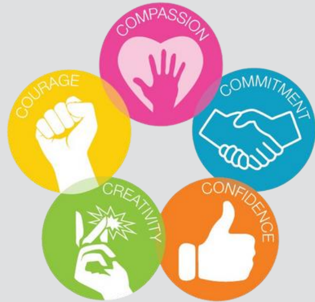
Customer Oriented Values & Commitments