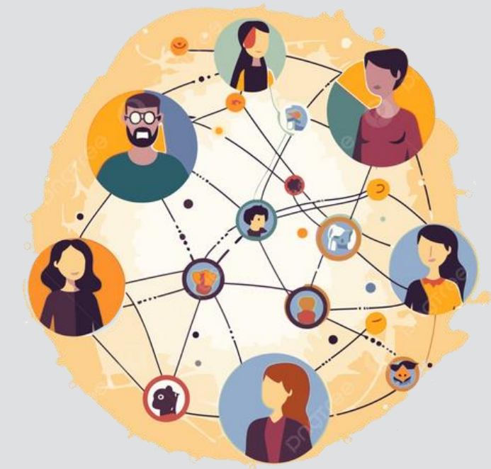
Strong network and connections