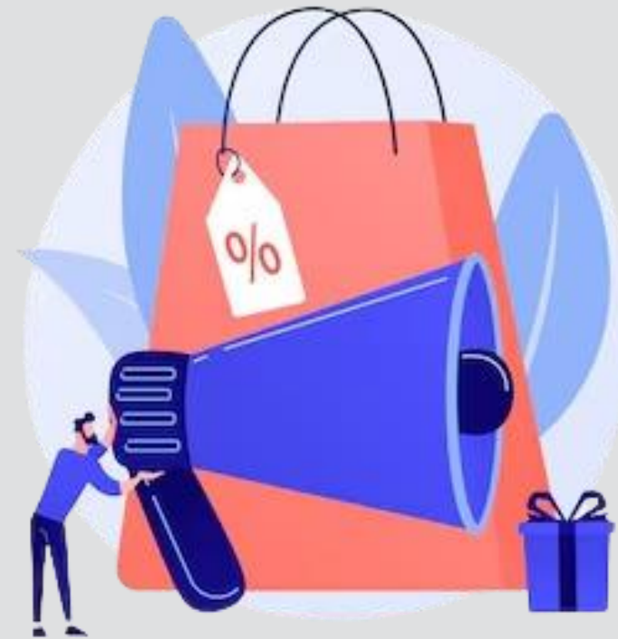
Frequent customer engagement with various promotional activities